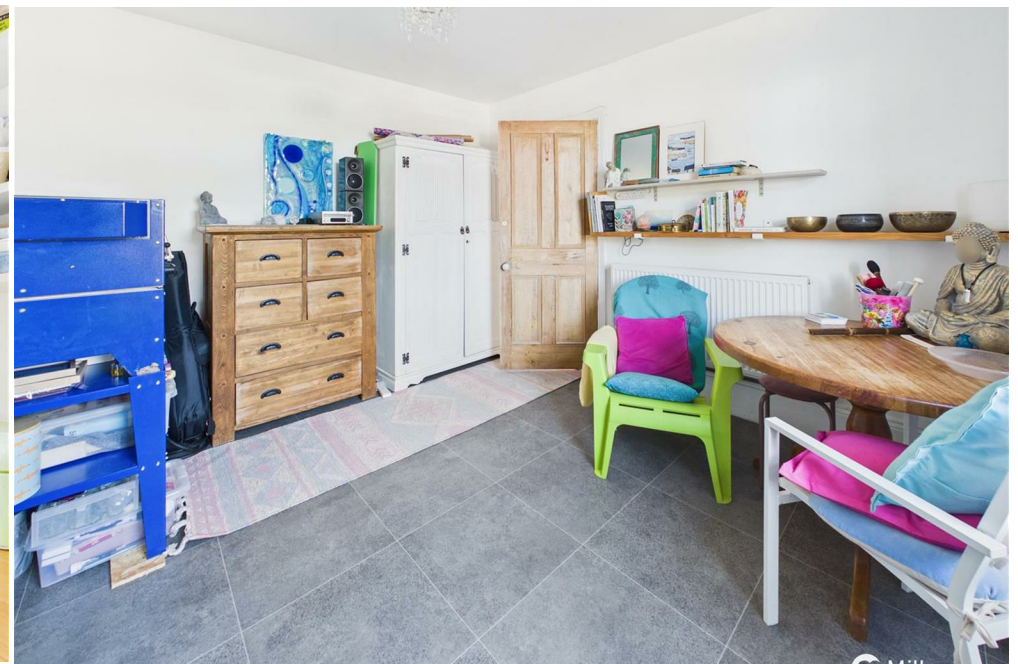
New Terrace, Treswithian, Camborne, TR14 7NF